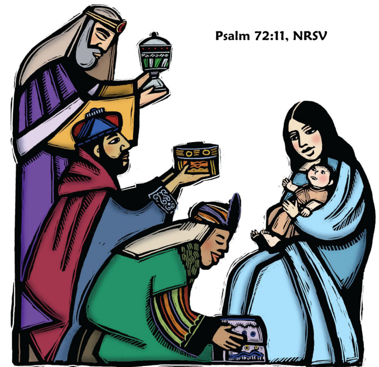
Psalm 72:11, NRSV

May all kings fall down before him, all nations give him service.